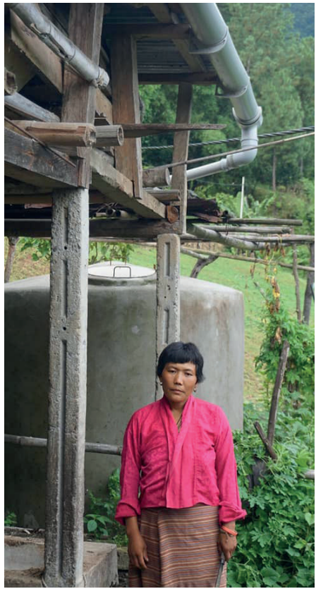
Cont. in page 2

people of Shali have effectively utilized the rainwater harvesting infrastructure for vegetable production.