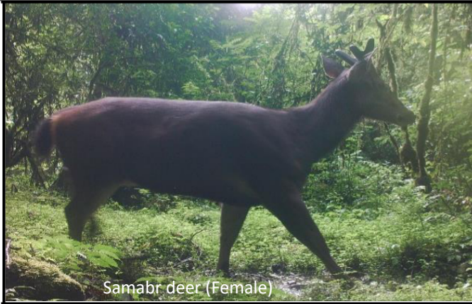
Sambar deer (Female)