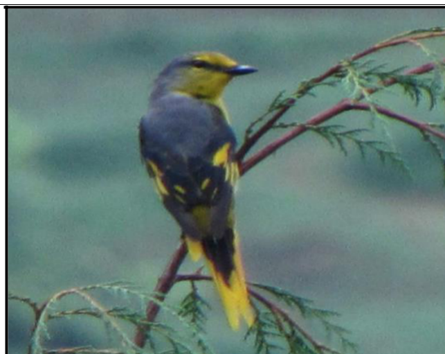
Long tail minivet