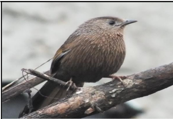
Bhutan Laughing Thrush