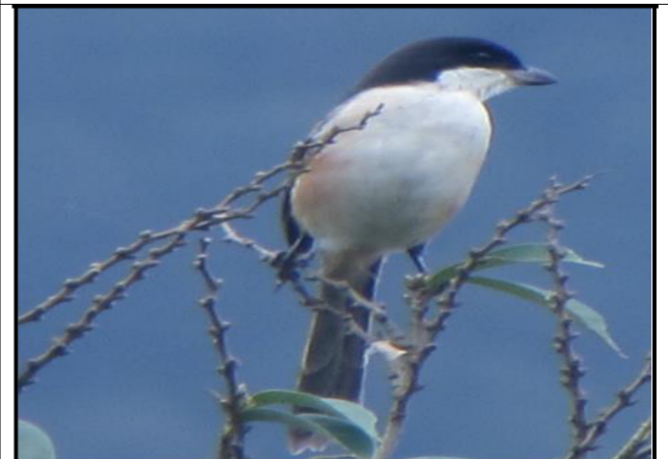
Long tail shrike