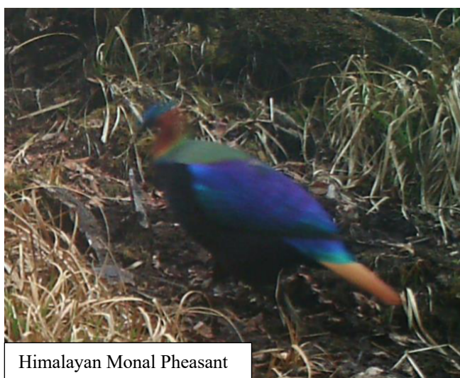
Himalayan Monal Pheasant