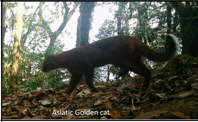
Asiatic Golden cat