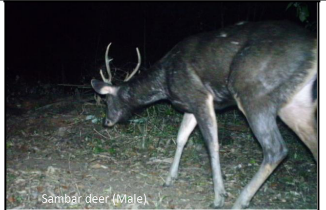
Sambar deer (Male)